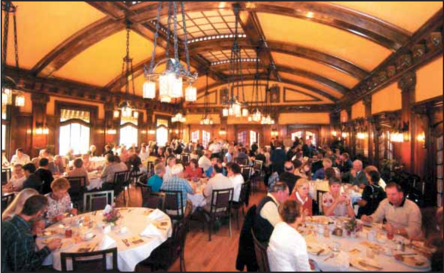
Brunch in the Royal Alexandra Hall

FLOOR PLAN & PRICE FOR BRUNCH DETAILED ON TICKET ORDER FORM INSERT