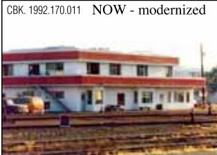
CBK. 1992.170.011 NOW - modernized

The building is probably THE most important historic symbol of the importance of the railway to the city. The idea of saving and restoring the structure as an important part of Cranbrook and Railway heritage goes back to the formation of the Cranbrook Archives, Museum and Landmark ("CAMAL") Foundation in 1976. It was also an important part of the Museum Master Plan done by professional consultants under a National Museums of Canada program in 1990. That Plan noted " the building should be saved regardless of what uses it might be put to ".